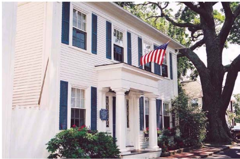
The Harborside Inn 3 South Water Street Edgartown, Massachusetts